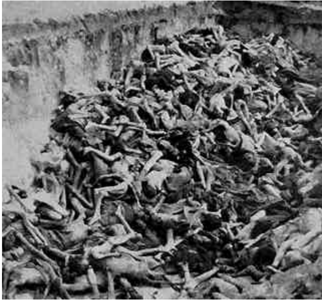
Corpses in mass grave at Auschwitz